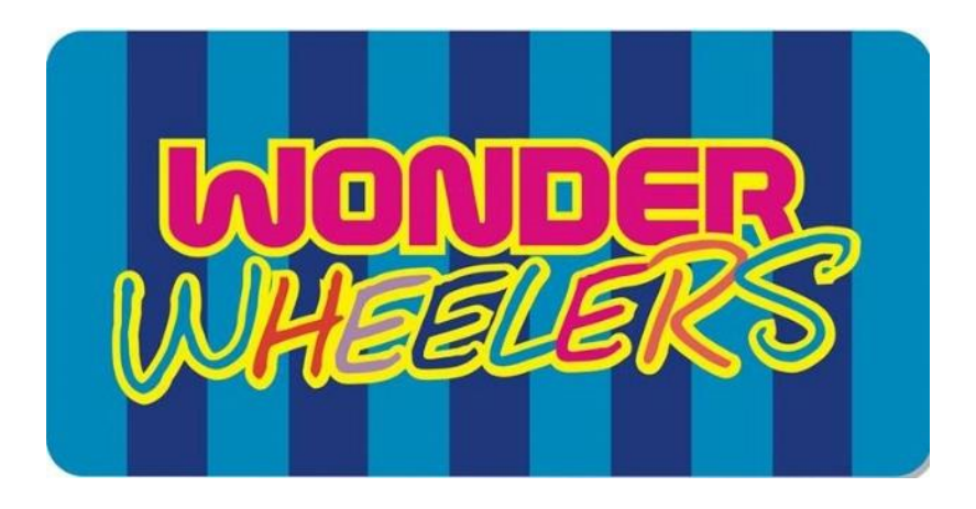
Alongside Circus Avago there is also the opportunity to try - Wonder Wheelers

Weird and Whacky bicycles, unicycles, Penny Farthings, bendy bikes, tall bikes, mini-bikes and mini-tandems, eccentric wheelers, circus bikes, balance trikes, fun wheels, pedal goes and more!