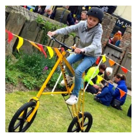
Try the unrideable bicycle challenge - steer one-way and it goes the other!

Huge fun for all ages, participants and spectators!